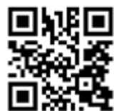
2013 Audited Financial Statement

Total assets, $17,969,329 Total revenues (donations and investment gains), $2,705,956 Grants and scholarships awarded, $508,925 Operating expenses, $256,524