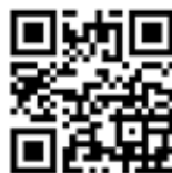
2013 IRS Form 990

SPECIAL THANKS to our investment advisers and the local and regional financial institutions where they work for providing outstanding services at a reduced fee in support of the mission of the Community Foundation.